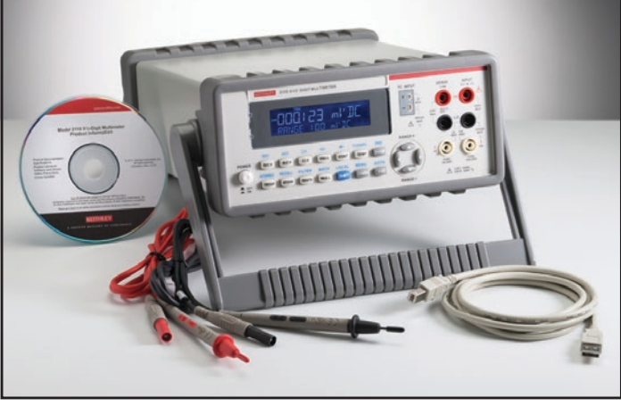
All accessories, such as start-up software, USB cable, power cable, and safety test leads, are included with the Model 2110.